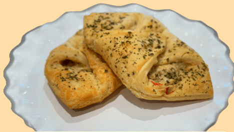
TURKEY SAUSAGE & CHEESE CROISSANT