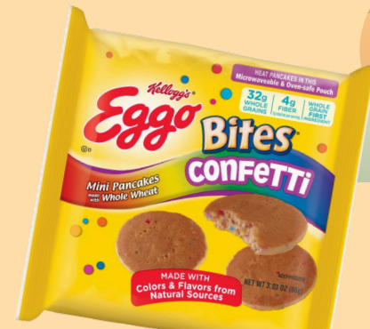
MINI CONFETTI PANCAKES