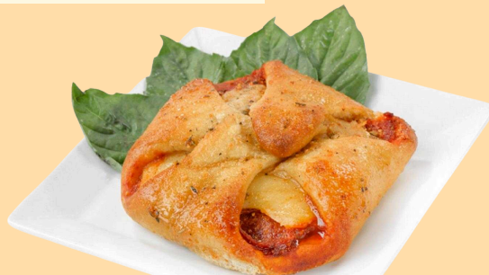
PIZZA PASTRY (TURKEY PEPPERONI OR ROASTED VEGGIE)

CHECK OUT THE NEW HAWAIIAN BUN FOR HAMBURGERS, CHEESEBURGERS AND THE CHICKEN SANDWICH!