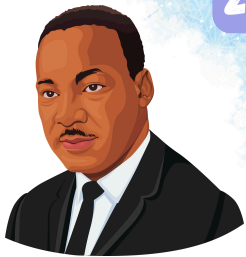
Martin Luther King Jr Day