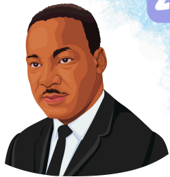
Martin Luther King Jr Day

Cheese French Bread Pizza Edamame Fresh Orange Slices